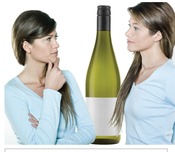
The article abstract can be found here:

Though these results are preliminary, the study's authors state that they could influence future efforts to study genetic risk factors for AD. The authors note that previous studies "have looked at the magnitude of aggregate genetic effects, developmental processes, or patterns of comorbidity assuming that AD reflected a single dimension of genetic liability." They recommend reconsidering these earlier conclusions in light of the results of this study. This new study indicates that several genetic factors—not just one influence risk for AD. As a result, the study's authors argue that the assumption of a single genetic risk factor "is unwarranted and should not continue to be accepted before being subjected to empirical test."